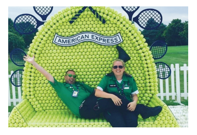
▶ Game of Thrones: In between hectic shifts, these two volunteers grabbed a quick rest on a chair truly fit for a champion of the courts!

Wimbledon, the volunteers were ready to treat hundreds of casualties – on and off the court. They treated people during the course of the competition and carried out transports to the hospital. Since 1988, the St John Ambulance has treated well over 37,000 people at the event.