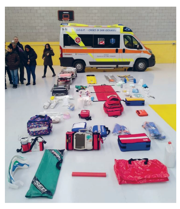
▶ Participants in the mobility scheme examine ambulance equipment in Turin

EUINAID is an Erasmus+ project aiming to improve skills and competences of young people from 18 to 25, especially those who are not in education, employment or training (NEETs) and youth workers in the field of Health Assistance. Within this project, the JOIN Office works together with our members Johanniter Austria, Hungary and Italy as well as three other humanitarian