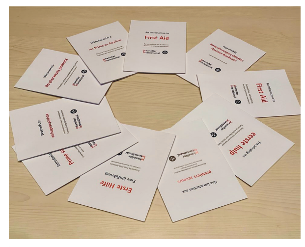
▶ The JOIN European First Aid Guidelines are available online in 15 languages.

The JOIN Guidelines are available in fourteen European languages: Danish, Dutch, English, Estonian, Finnish, French, German, Greek, Hungarian, Italian, Latvian, Polish, Spanish, Swedish, and also Arabic.