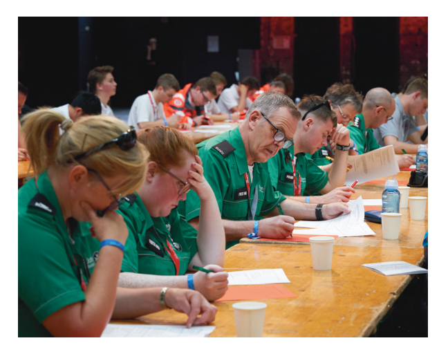
▶ St John Ambulance Northern Ireland achieved top scores.

In the centre of the event were the 'Olympics of the rescuers', accompanied by a diverse three-day supporting program: an alumni meeting and a festive event, which celebrated the 40th anniversary of the Johanniter Youth. Another part of the programme consisted of special events on care topics, education and rescue, and a panel discussion on the future of outpatient care.