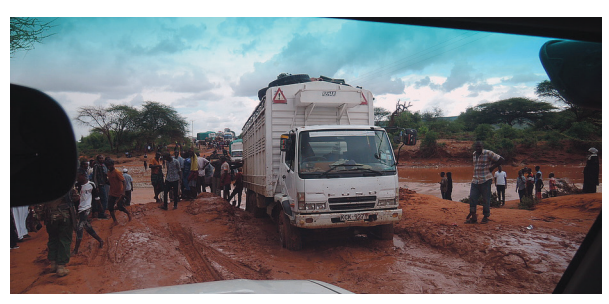
Northwestern Kenya has been affected most by floods and landslides.